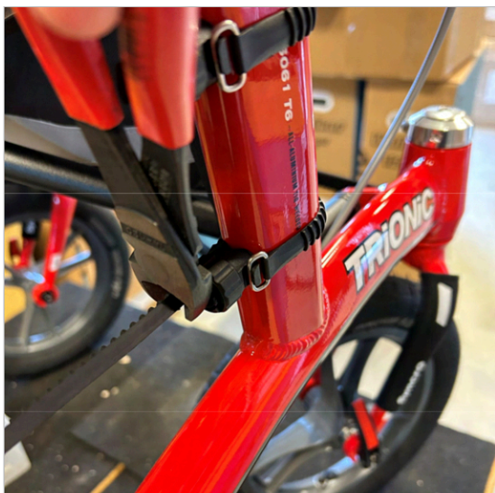
⑤ Mount the second holder in the same way.