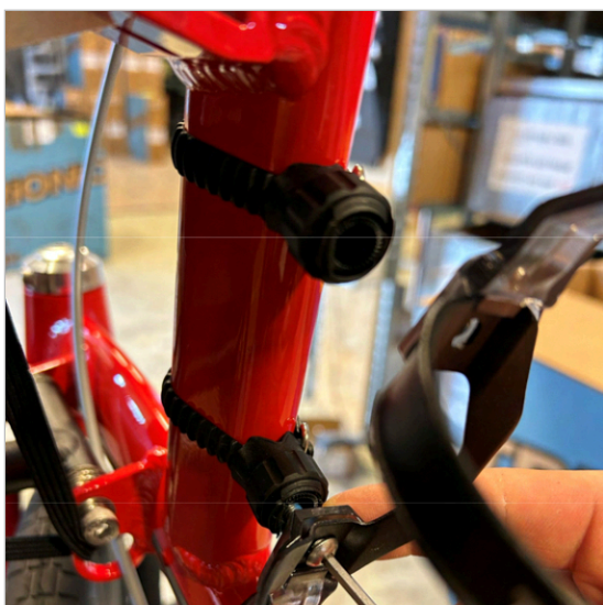
⑦ Attach the bottle holder with the two screws. The “opening” of the bottle holder should face outwards.