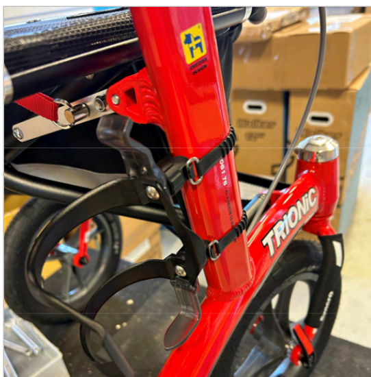
⑧ The bottle holder is now attached to the frame and you enter the bottle from the side and remove it outwards.