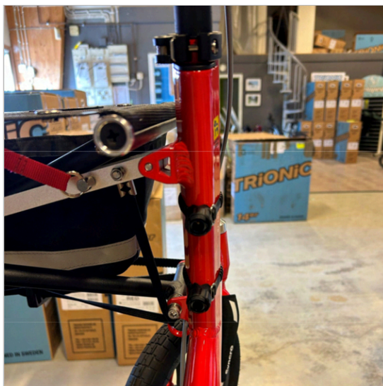
⑥ The two holders correctly assembled on the frame tube.